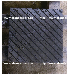
拉槽 Slot broaching