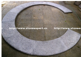
弧形缘石 Curved Border